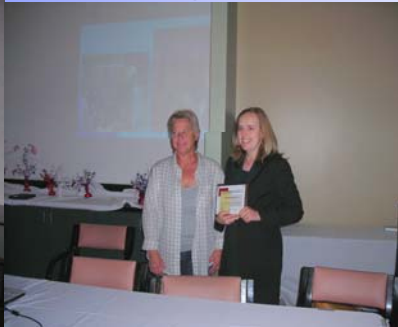
Safety-2011 Gr. Kansas City #100