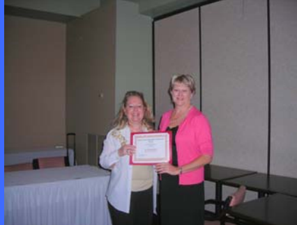
Community Service—2 nd 2011 Greater Wichita Kansas #120