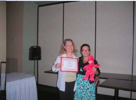
Community Service-1 st 2011 St. Louis MO #38