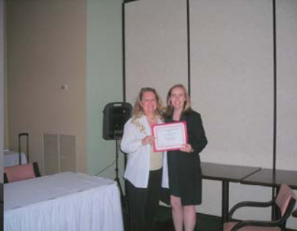
Construction Industry-2011 Greater Kansas City #100