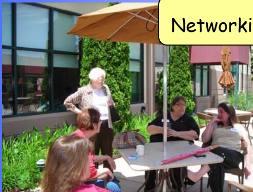
Networking in the sun!