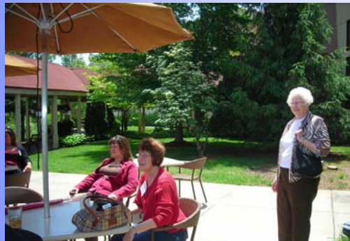
Welk Resort Branson MO